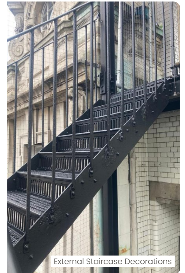
External Staircase Decorations